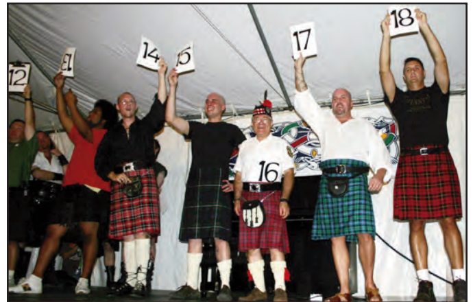
Some of the hot action from last year's Men in Kilts competition!

Currently, the event has nine stages featuring over 150 performances by various musicians and artists dedicated to celebrating the Celtic traditions from regions of Western Europe, Canada and the United States.