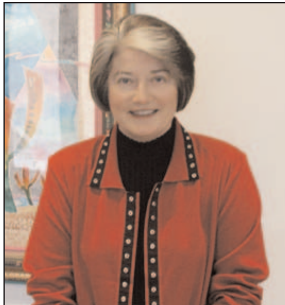
U. S. Bankruptcy Court Judge Pamela S. Hollis