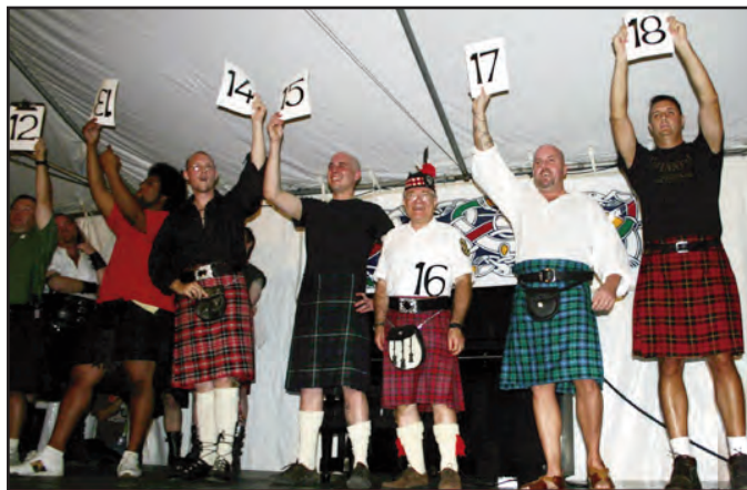
Some of the hot action from last year's Men in Kilts competition!

Currently, the event has nine stages featuring over 150 performances by various musicians and artists dedicated to celebrating the Celtic traditions from regions of Western Europe, Canada and the United States.