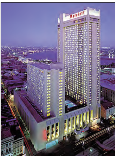
New Orleans Marriott, Canal Street