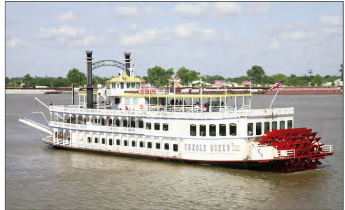
The New Orleans Paddlewheeler Creole Queen

On Friday, July 13th, presidents and past presidents of the nation's leading bankruptcy organization feasted on some of the current issues in consumer bankruptcy including (1) how Chapter 11 and reorganization affect consumer bankruptcy; (2) standards for post-confirmation plan modification; (3) use of post-petition income; (4) the judge's role and much more.