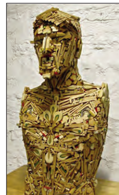
Piano Man made of piano parts.